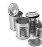
Steel food and beverage cans