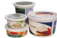
HDPE Tubs and Lids