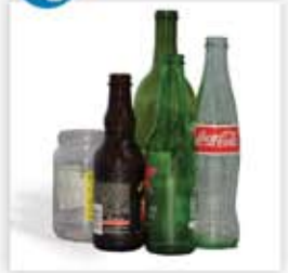
Bottles and Jars empty and rinse