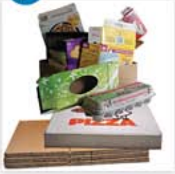
Boxes and Cardboard flatten