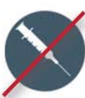
No Needles and/or Hazardous Materials