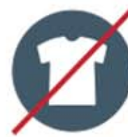
No Clothing or Linens (use donation programs)