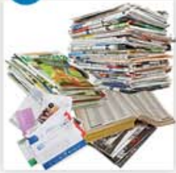
Printed Paper loose