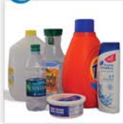
Kitchen, Laundry, and Bath: Bottles&Containers empty and replace cap