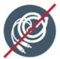
No Tangles (no hoses, wires, chains, or electronics)

Do not include any items just because they are made or contain paper, metal, plastic or glass.