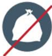
No Garbage Please